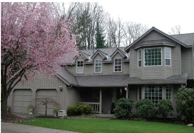
4663 161st Avenue SE