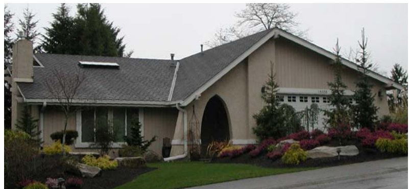
15338 SE 46th Way

If you would like to recommend a home to be highlighted in this way, please contact the editor (see back page).