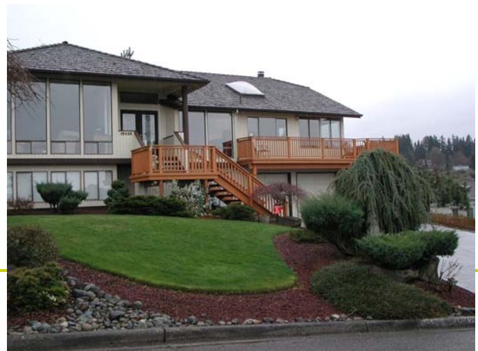
15429 SE 47th Street