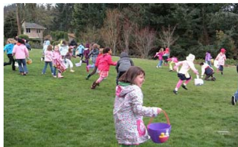
Fast kids, Egg Hunt 2010