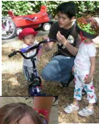
from July 4th parade, 2009